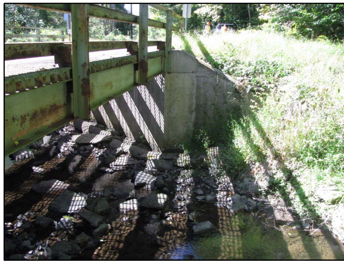
P-3: DOWNSTREAM BRIDGE ELEVATION LOOKING EAST