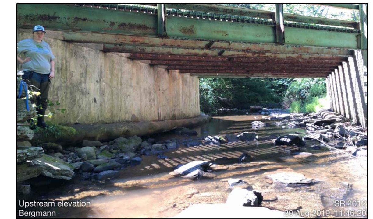
P-4: UPSTREAM ELEVATION