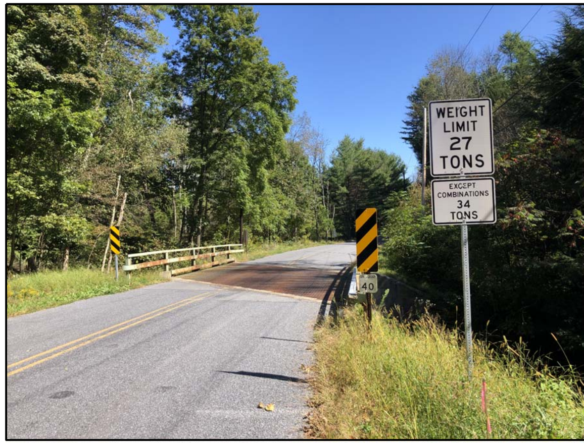
P-1: WEST APPROACH OF THE BRIDGE LOOKING EAST