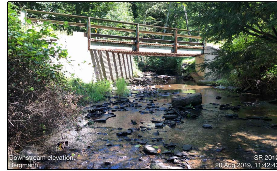
P-2: DOWNSTREAM ELEVATION