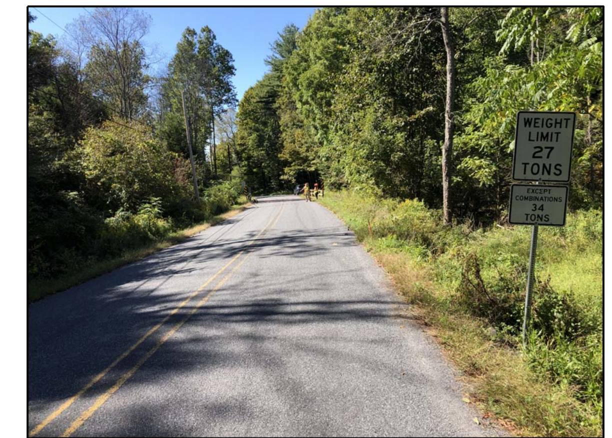
P-5: EAST APPROACH OF THE BRIDGE LOOKING WEST